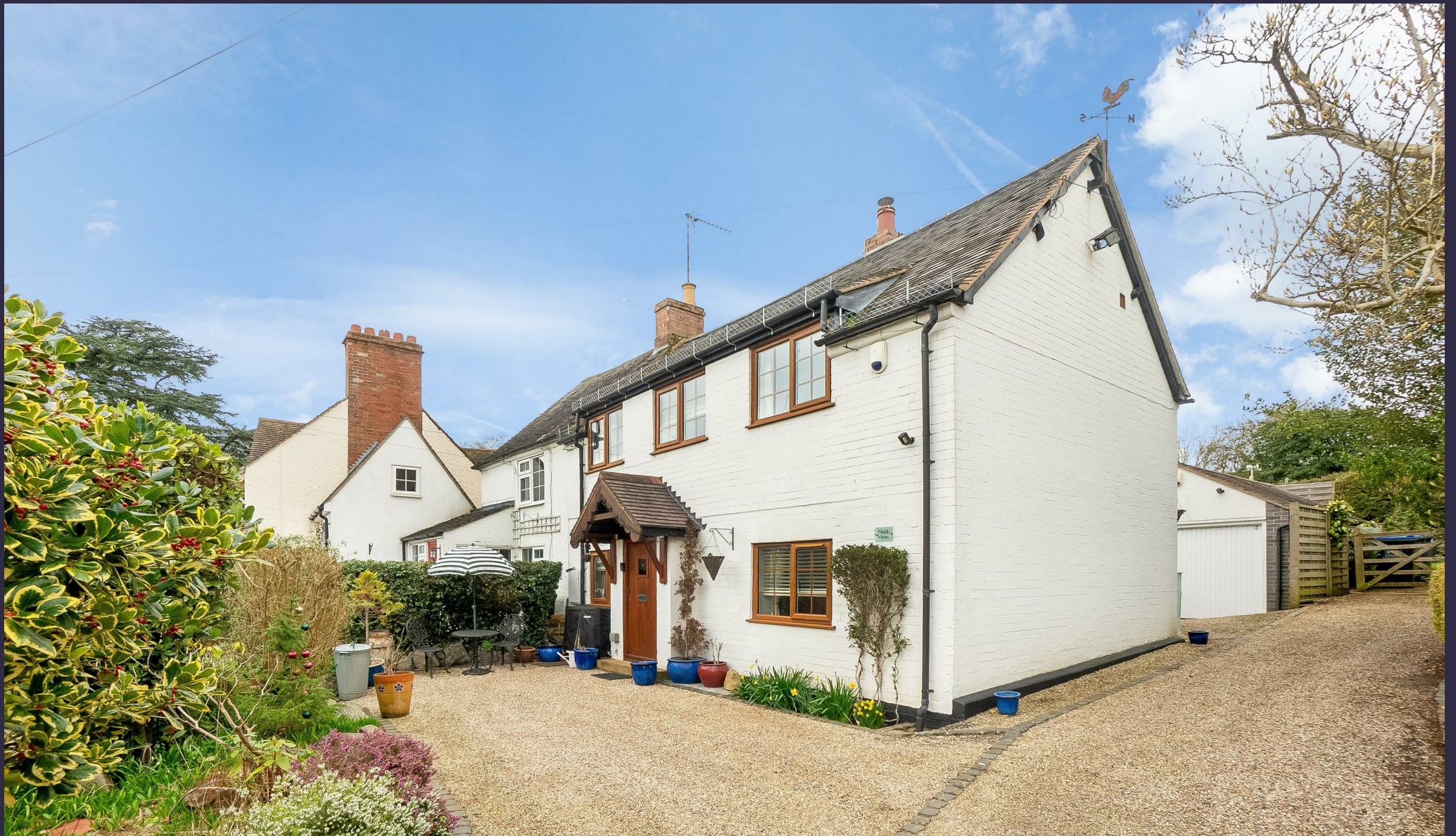
Field View Ashorne, Ashorne, Warwick, CV35 9DR